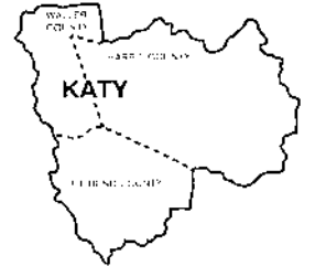
HUB CITY OF THREE COUNTIES